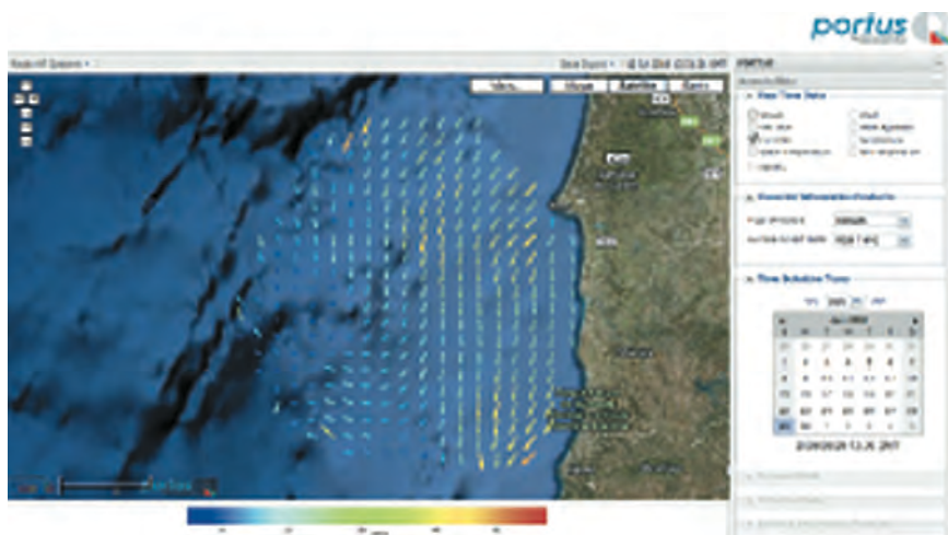
SeaSonde currents showed inside display screen of PORTUS BY QUALITAS oceanographic information system.

The Sines area, positioned halfway between Lisbon and Algarve, was chosen as the first permanent HF Radar deployment area since it is one of the most sensible locations of the Portuguese coast, having a major petrochemical harbor, and directly to the south, a natural reserve (Natural Park of the Southwest of Alentejo). Environmental monitoring by means of HF radar is understood as a preventive action to improve safety along one of the heaviest ship traffic corridors in the world. The radar network will complement the wave buoy deployed near the Sines Harbor (part of the national buoy network) as fixed monitoring systems, and allow a deeper knowledge of the circulation in this area.