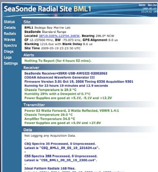
Images above are examples of the Release 6 Radial Web Display.