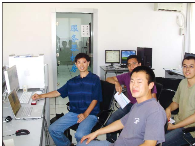
SOA scientists and Laurel Technologies engineers review the SeaSonde central management system residing at SOA North Branch headquarters.