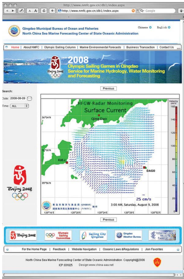
Snapshot of the SOA web page: http://www.nmfc.gov.cn/db1/index.aspx