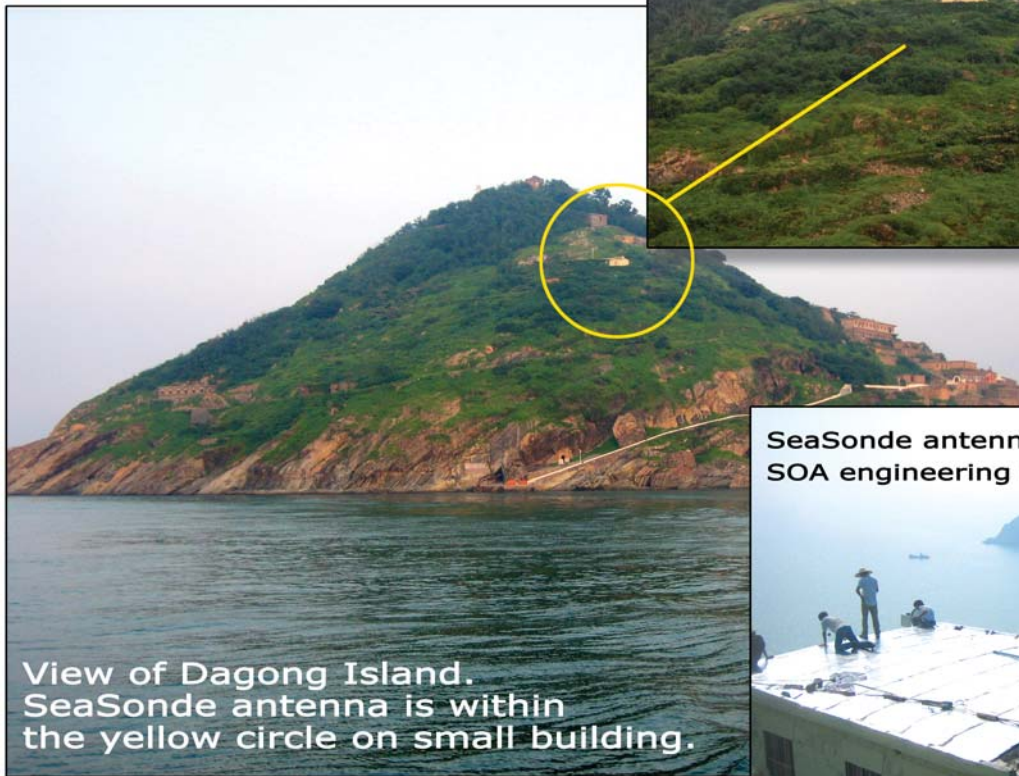
View of Dagong Island. SeaSonde antenna is within the yellow circle on small building.