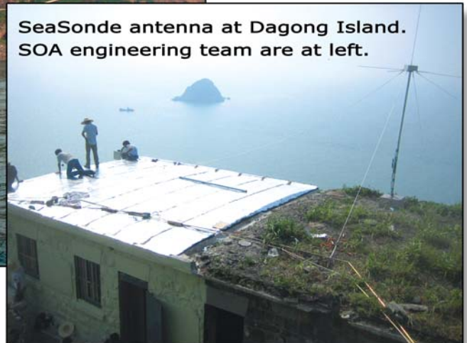
SeaSonde antenna at Dagong Island. SOA engineering team are at left.